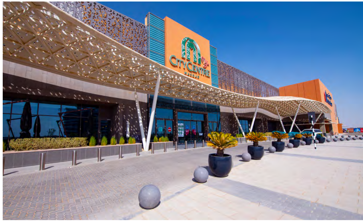
My City Centre Masdar

The City's growing residential, commercial, institutional, leisure and hospitality spaces, and cafés and restaurants are designed to offer a well-rounded urban experience in a unique environment where people can live, work, learn and play.