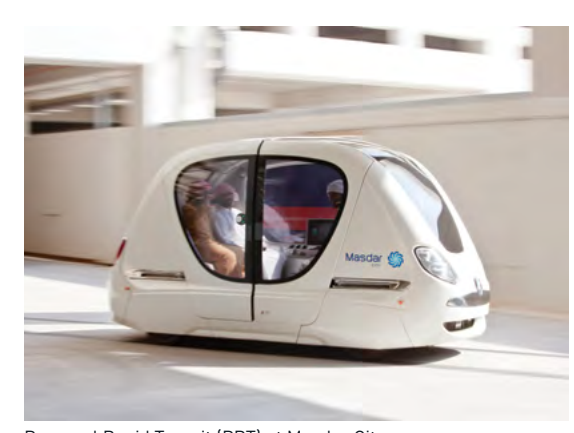
Personal Rapid Transit (PRT) at Masdar City

The next phase of the City's evolution will see the development of homes, schools, mosques and parks, along with additional cafés, restaurants, as well as service and retail outlets. Various urban components are master-planned to connect with pedestrian pathways as well as its rapidly developing public transport system.